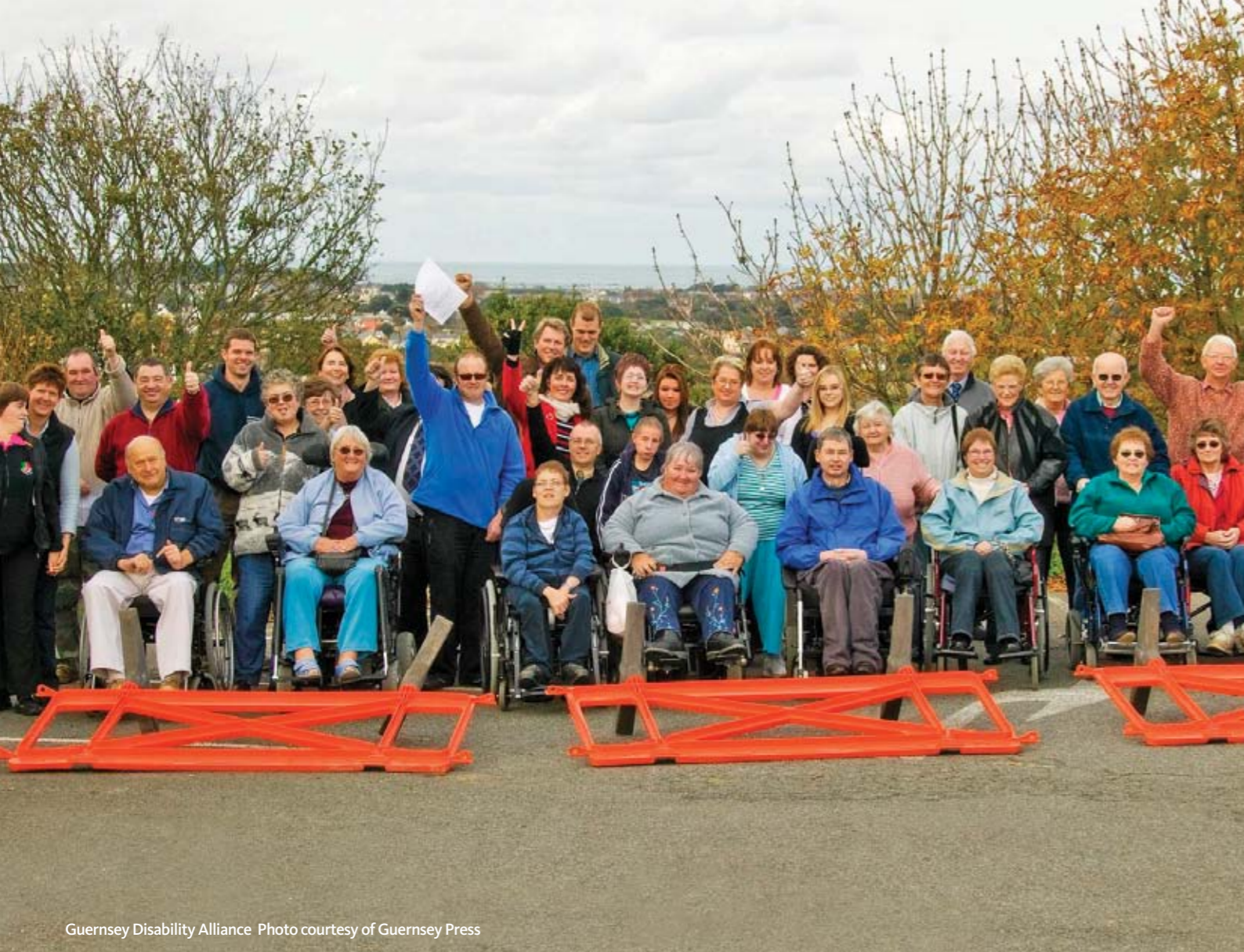
Guernsey Disability Alliance