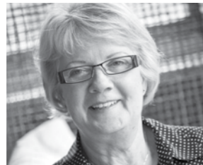
Dame Mary Perkins, DBE